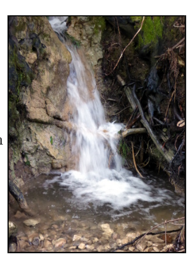
Redwood Creek falls