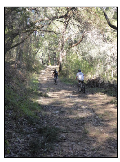
Two more bikers

with the design, construction and maintenance of both the Emma McCrary and U-Con Trails, such advertising in a public open space is not appropriate, and these signs should be removed.