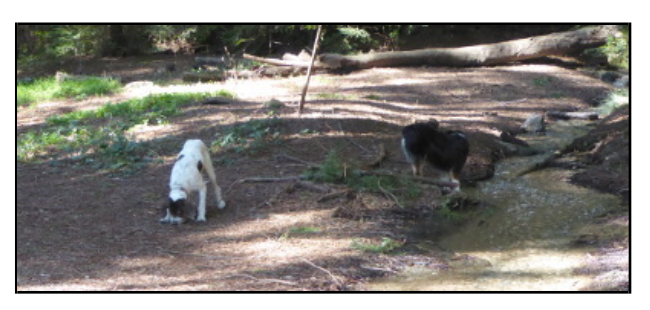
Two unleashed dogs

We saw several dogs off-leash, two of which are shown at the left, next to Pogonip Creek. (The darker dog is barely visible.) We also walked down the Ohlone Trail.