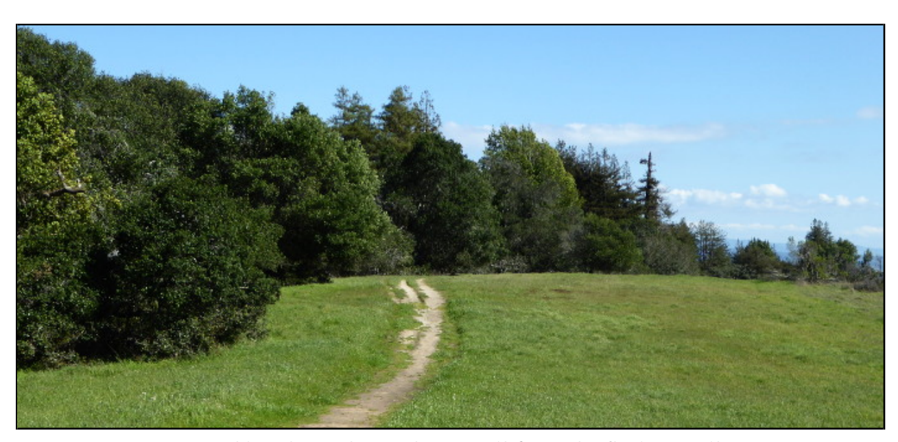
Looking down the Lookout Trail from the Spring Trail

February 26 was a beautiful Spring day following the rain, so the three of us went for a walk on the Pogonip. There were many others on the Spring Trail, out to get some exercise, breathe the fresh air and enjoy the wonderful day.