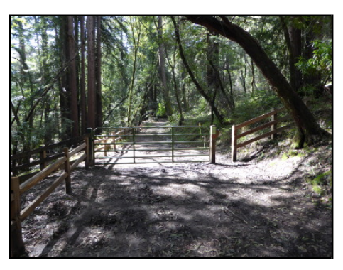
We closed the gate

We then walked on down, and discovered that the gate across the Rincon Trail, just above the connection with the U-Con Trail, was wide open. It is normally closed, so we closed the gate, and in the process, discovered that the gate, which