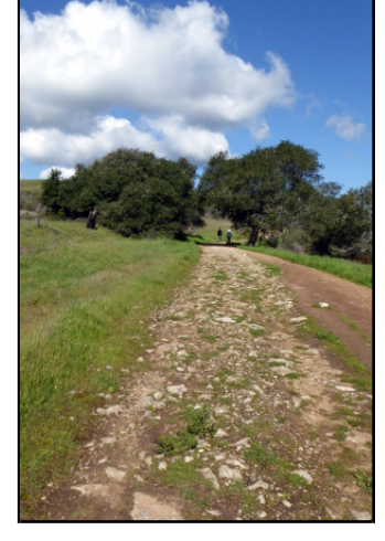
Old road remnant

On the next page is another photo, showing the first of four bicyclists we met on our walk. This little fellow was coming along with his mother. We stopped and told the mother that bicyclists were not permitted on the Spring Trail. She had no idea that bicyclists were not permitted, as she had seen no sign or other indication to that effect. She thanked us and headed down with her son and dog to the Spring Street entrance.