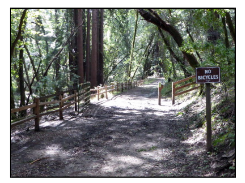
Gate wide open

We then walked on down, and discovered that the gate across the Rincon Trail, just above the connection with the U-Con Trail, was wide open. It is normally closed, so we closed the gate, and in the process, discovered that the gate, which