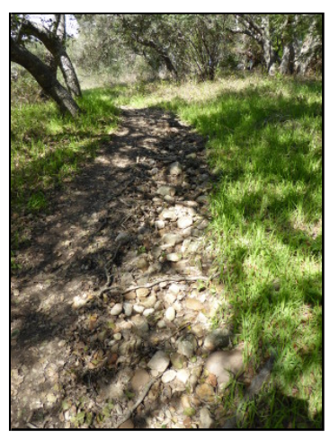
Lower Ohlone Trail

At the left is the lower Ohlone Trail, which is badly eroded, and needs repairing. At the right is the waterfall of Redwood Creek, one of the several spring-fed creeks that emerge within the Pogonip from the large aquifer above. Like Pogonip Creek, this stream flows year-round, although somewhat fuller in the rainy season than in the dry season.