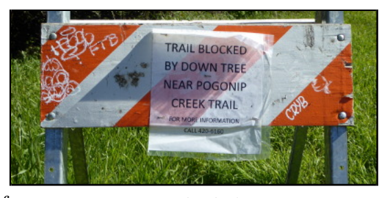
right is a sign at the top of Trashed sign the Lookout Trail that has been present for several weeks (at least since December 25) and has been marked with graffiti. The down