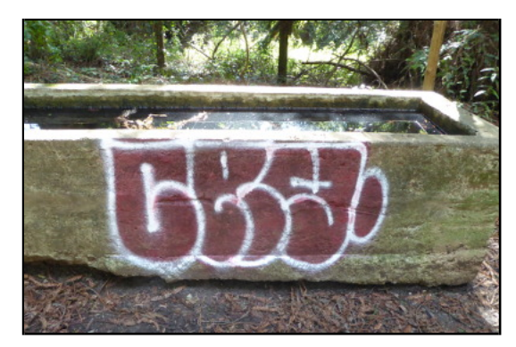
Historic watering trough

The historic watering trough, near the crossing of Pogonip Creek by the Spring Trail, has unfortunately recently received this ugly graffiti. This trough, by the way, is quite interesting. It was originally fed by Pogonip Creek, which flows at a remarkably steady rate throughout the year, during both the rainy wet season and the dry summer months. Note the notches in the corners of the trough (not visible in this photo). These were cut to be at about the same elevation as the water in the spring box where the creek emerges, about fifty