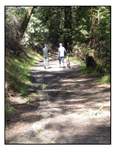
Biker willingly leaving

... where we encountered our second mountain biker. We talked with him to let him know that bicyclists were not allowed on the Spring Trail. He was from San Francisco, and totally uninformed, so he was quite willing to walk his bike back down the trail toward the intersection of the U-con trail and the Emma McCrary trail, where he had come from, and where bikers are permitted.